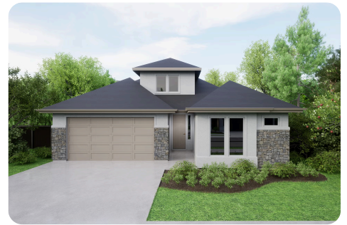
A - Contemporary