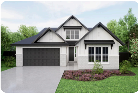
C - Modern Farmhouse